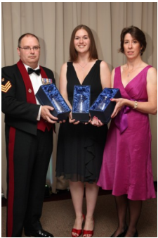
AAH/APTUK Award Winners 2008

We will continue to build links with key stakeholders working together to ensure that pharmacy technicians continue to play an integral role in the advancement of pharmacy.